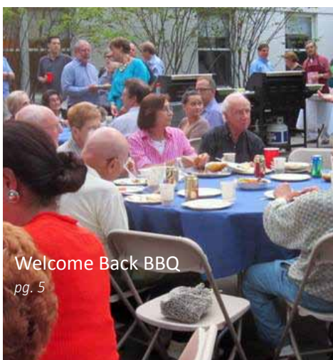
Welcome Back BBQ pg. 5

Travel to Israel (without leaving WRT) pg.11