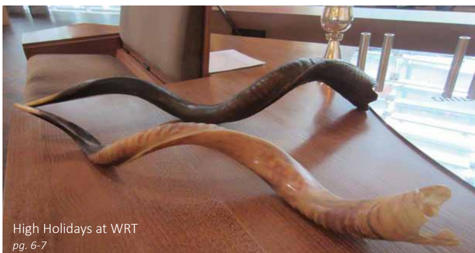
High Holidays at WRT pg. 6-7