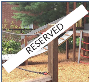
Rising Suspension Bridge