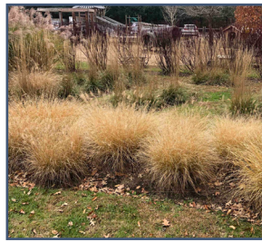
Ornamental Grass Garden