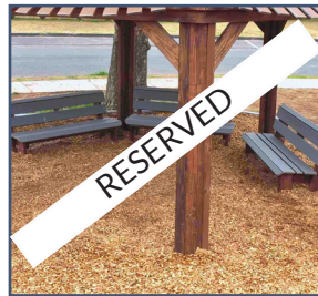
Pavillion Bench (x3)