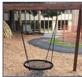
Basket Swing Structure