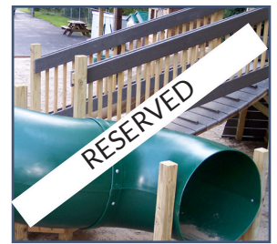
Dry Bed Bridge