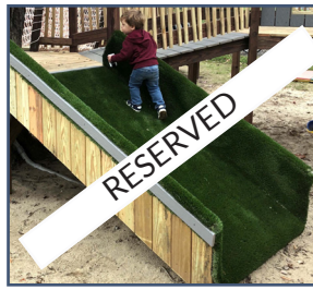
Artificial Climbing Ramp