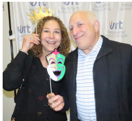
Purim Battle of the Bands