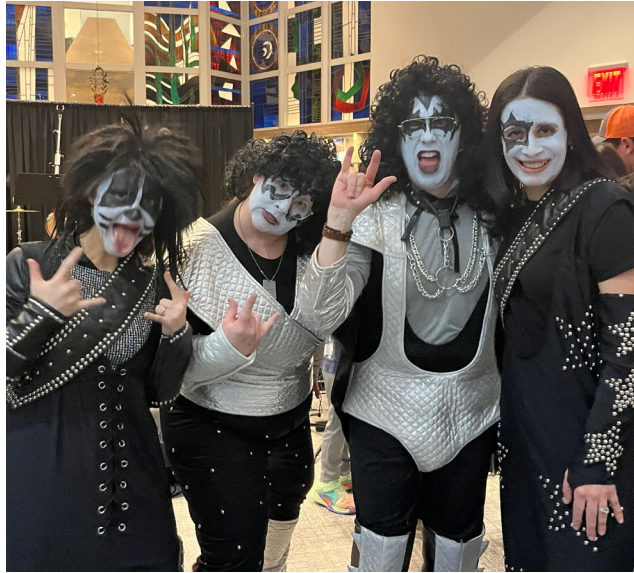
Purim Battle of the Bands