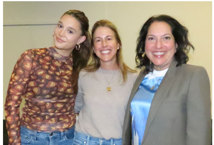
Purim Battle of the Bands