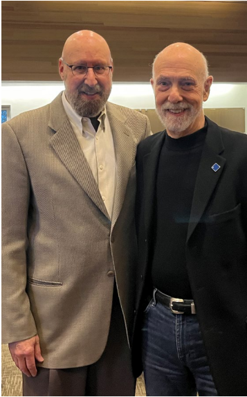
MRJ Seder of World Traditions