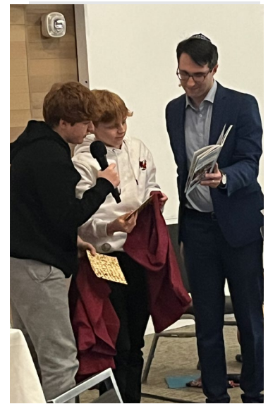
MRJ Seder of World Traditions